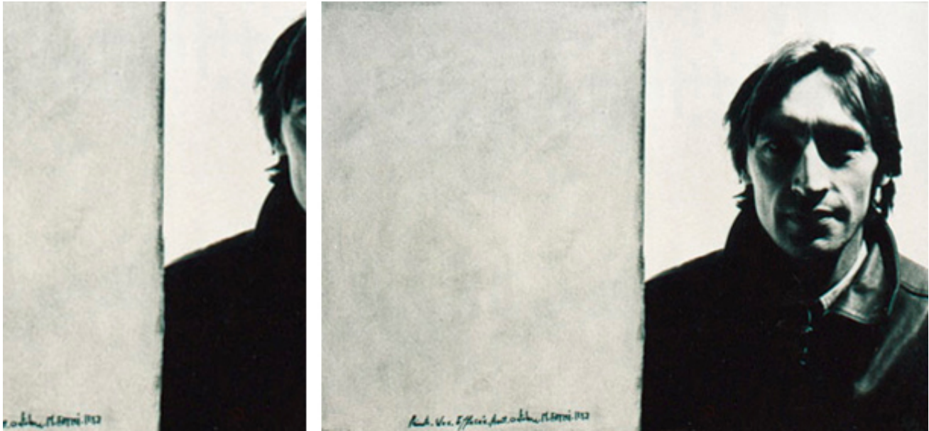
Paintings and photos started in 1996, acrylic on paper, photographs and videos. Exhibition view from Paris-Casa, suites marocaines, Couvent des Cordeliers, 1999, Paris.

Le projet pictural « Effacement mémorisation » convie les spectateurs à observer, à se saisir des instruments du peintre et à poser devant l'objectif d'un appareil photographique. L'artiste a rassemblé plusieurs peintures appartenant à sa production antérieure, œuvres proches de l'abstraction et de la figuration libre, qui ont bénéficié de la reconnaissance du milieu de la critique d'art. Des spectateurs anonymes sont placés face aux œuvres, convoqués d'abord en tant que témoins de leurs existences, puis comme acteurs aidant l'artiste à recouvrir les toiles vues de plusieurs couches de peinture blanche, et finalement comme modèles photographiques dont les portraits sont associés aux peintures recouvertes et signées « Peint, vu, effacé ».