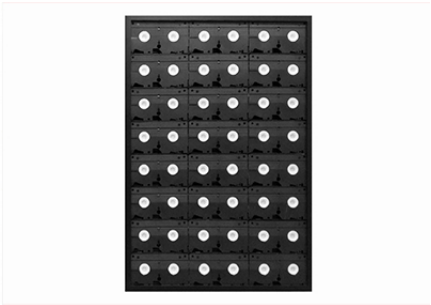
2017, VHS Cassettes, framing, 87 x 59,5 cm. Courtesy of the artist. Ed. of 25 + A.P.