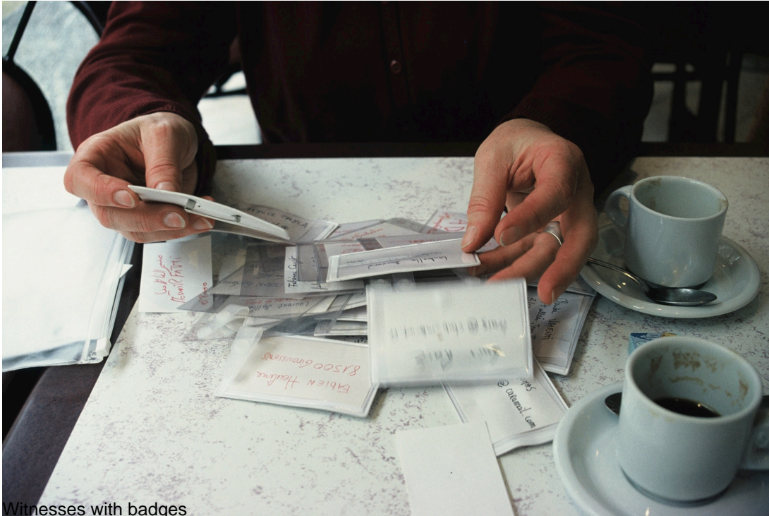
Witnesses with badges

The Witnesses with Badges series started in 1999. During a residency at the Cité Internationale des arts in Paris, the artist wrote his name on a large number of badges and offered passers-by to exchange identities with him.