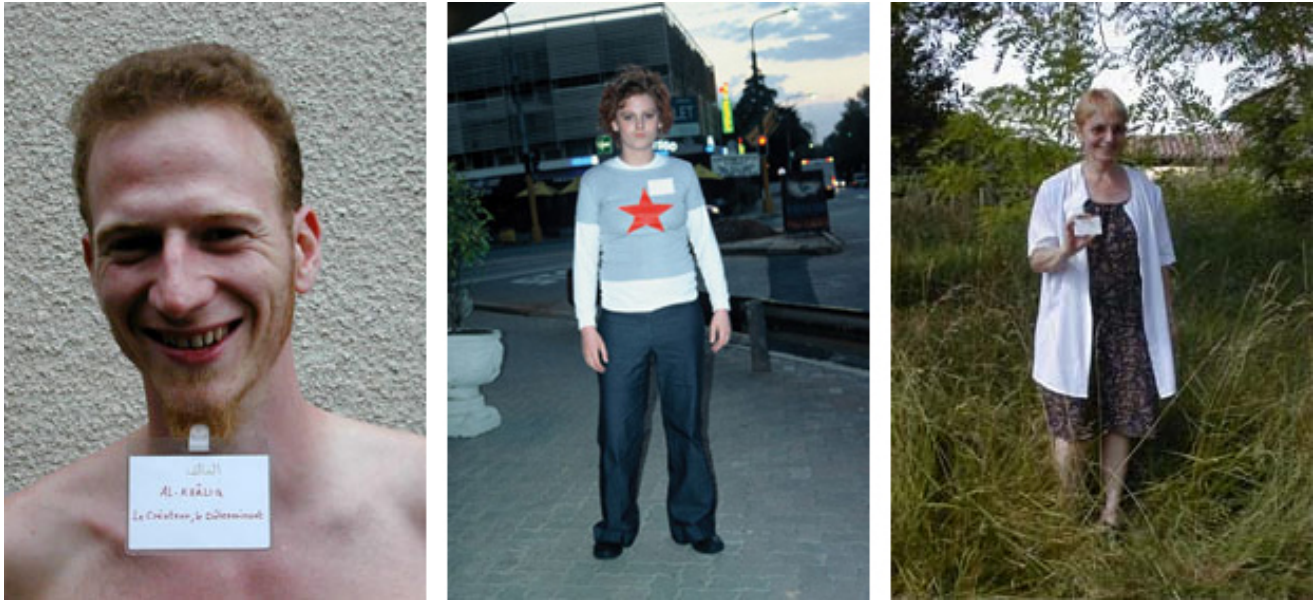
Started in 1999, photographs, silver print, various size. Exhibition view from 10 familles, 10 artistes +si affinité, 2000, Fiac. Ed. of 5 + 2 A.P.

This work was part of 4ème Biennale de Dakar - Biennale de l'Art Africain Contemporain, Dakar, 2000.