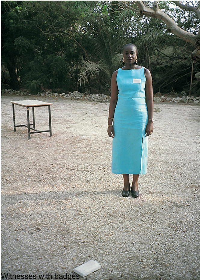
Witnesses with badges

Mounir Fatmi displaces these identities that have become less anonymous and distributes them to new bearers. With each voyage, the badge, a detachable object with an elective identification, is placed on a new body for an extensible period of validity.