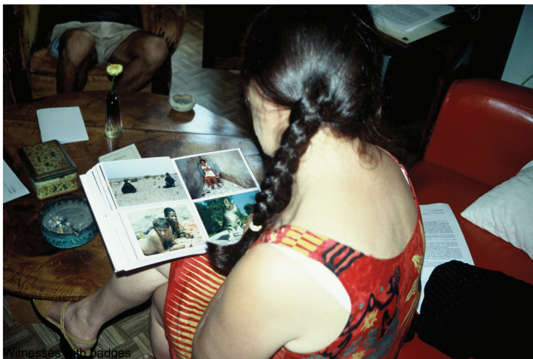
Witnesses with badges

The people who accepted this symbolic exchange wrote their name on badges of their own. The exchange consisted in sticking the badge with the artist's name on their chest. This is how the series of photographs and journeys begins, in which the badges collected in one country and exchanged in another.