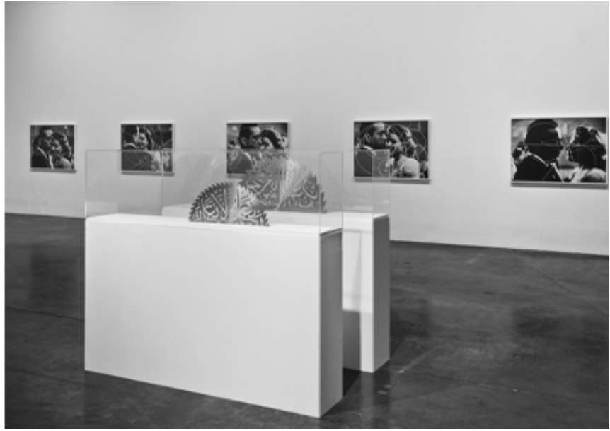
Kissing Circles, mounir fatmi, SF Publishing, 2020