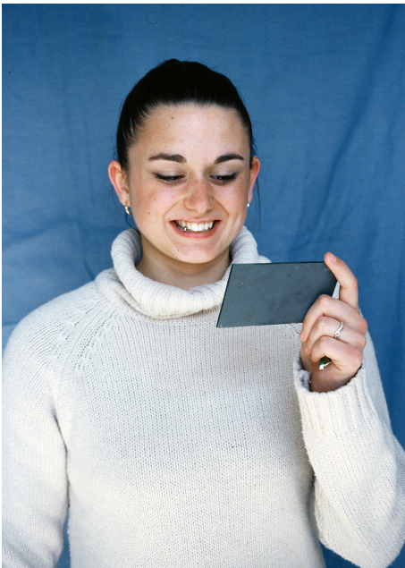
Studio Fatmi, June 2000

relays the artist's sensitive experience with the person who "sees" and most importantly "has seen" what we, the viewers, cannot. "