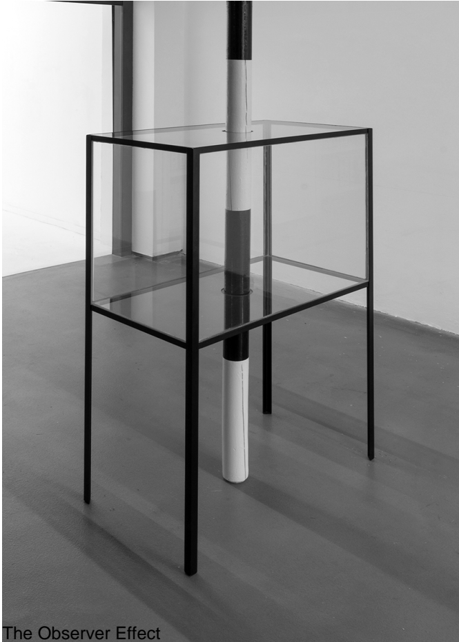
The Observer Effect

Does the exhibition space always cause the risk of congealment, immobilization, or even of abolition of the artistic gesture and its vitality? Is that gesture necessarily destined to reach beyond the imposed boundaries? Is the exhibition space, a space regulated by norms, conventions and protocols that are foreign to the artistic work, inadequate by nature?