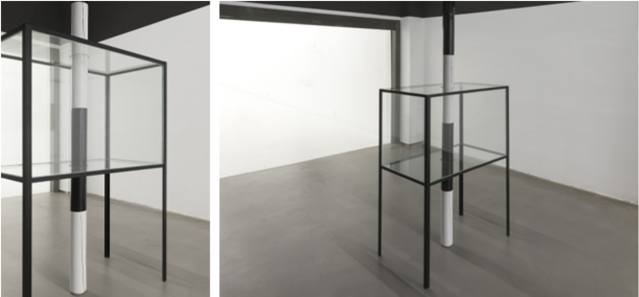
2021, Obstacle, pedestal and showcase. Exhibition view from The Observer Effect, ADN Galleria, 2021, Barcelona. Ed. of 5 + 1 A.P.

La sculpture « The Observer Effect » provoque la rencontre surprenante entre une vitrine muséale et une barre de saut d'obstacle hippique. D'emblée, la sculpture pose un problème de relation et d'espace : les dimensions des objets représentés semblent en effet mal s'ajuster les uns aux autres. La barre de saut d'obstacle, qui apparaît dans une position dont elle n'est guère coutumière - dressée, verticale - longue de plusieurs mètres, traverse la vitrine de dimensions plus petites.