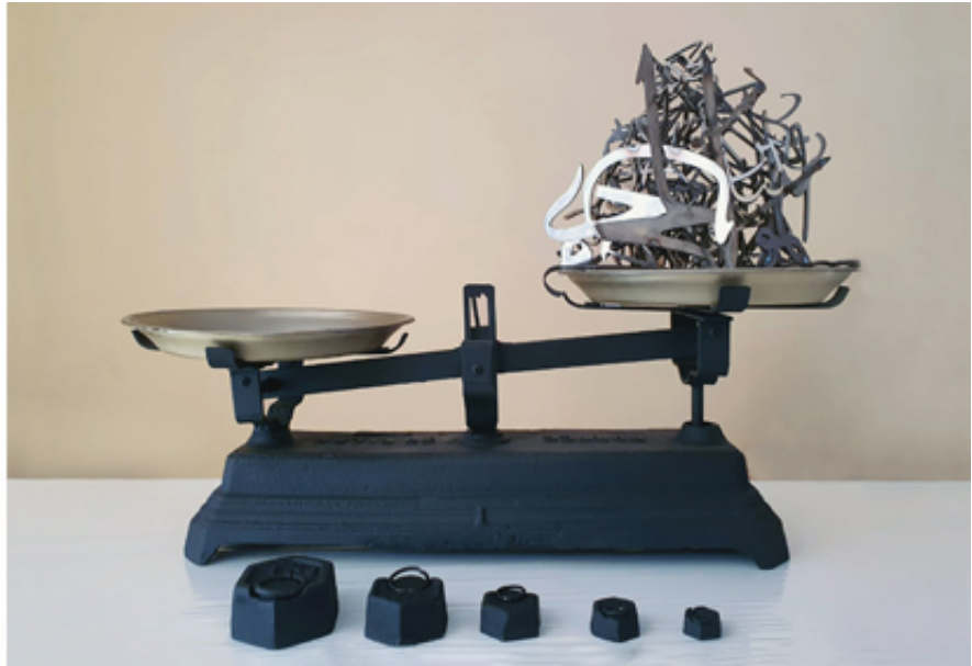
2020, Cast iron balance, arabic calligraphies of steel. Ed. of 5 + 1 A.P.