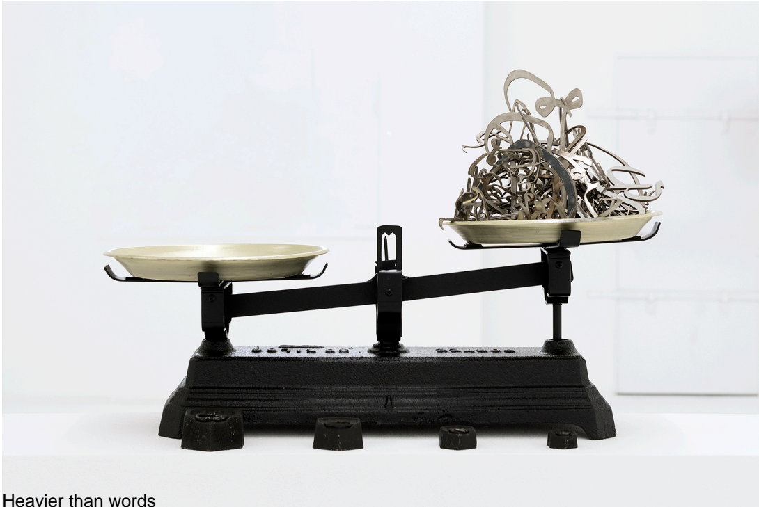
Heavier than words

At first glance, everything seems normal, but the sculpture actually exhibits a paradoxical balance that clearly leans towards the side with the empty tray, whereas the other tray is filled with metallic calligraphic motifs.