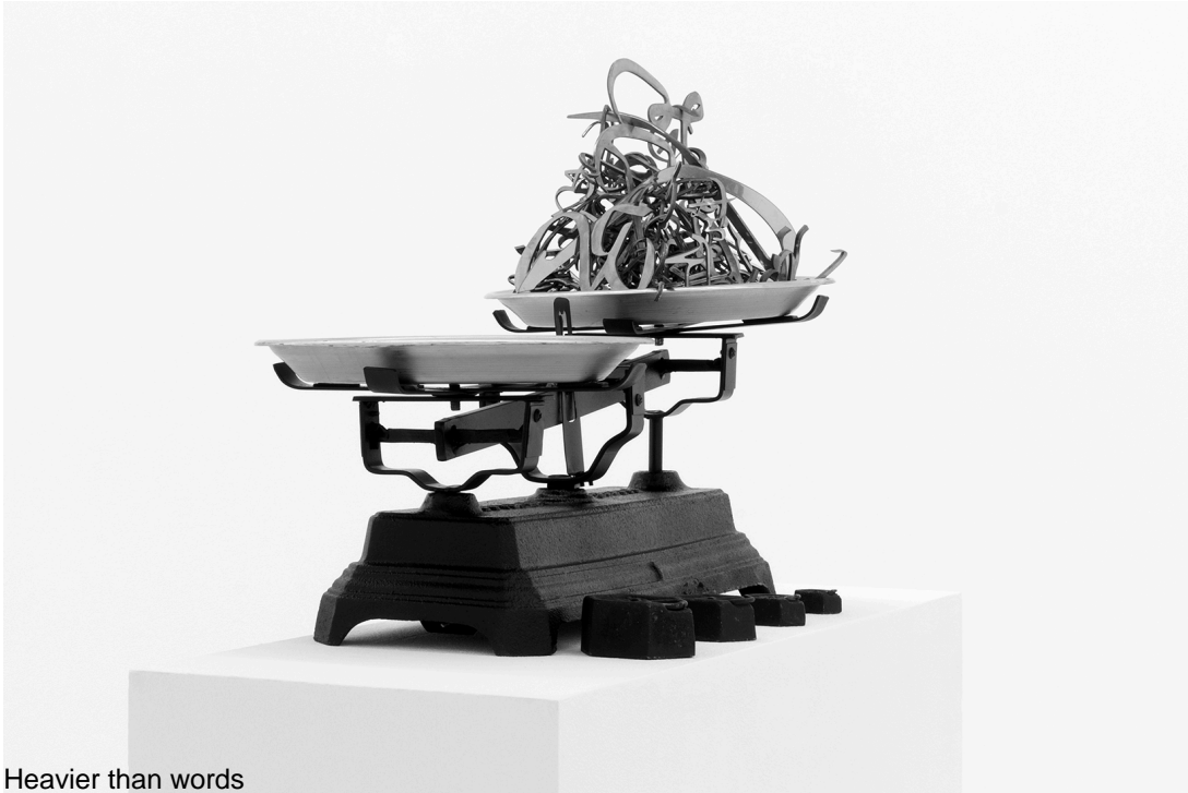
Heavier than words

The deconstruction of language and machine is one of the main focuses of mounir fatmi's work. The sculpture Heavier Than Words poses the triple question of emptiness from a scientific perspective, of the power of thought and of the limits of language. The interrogation on language brought forth with this sculpture resembles a physics enigma. What weighs more than words? What has more power than language?