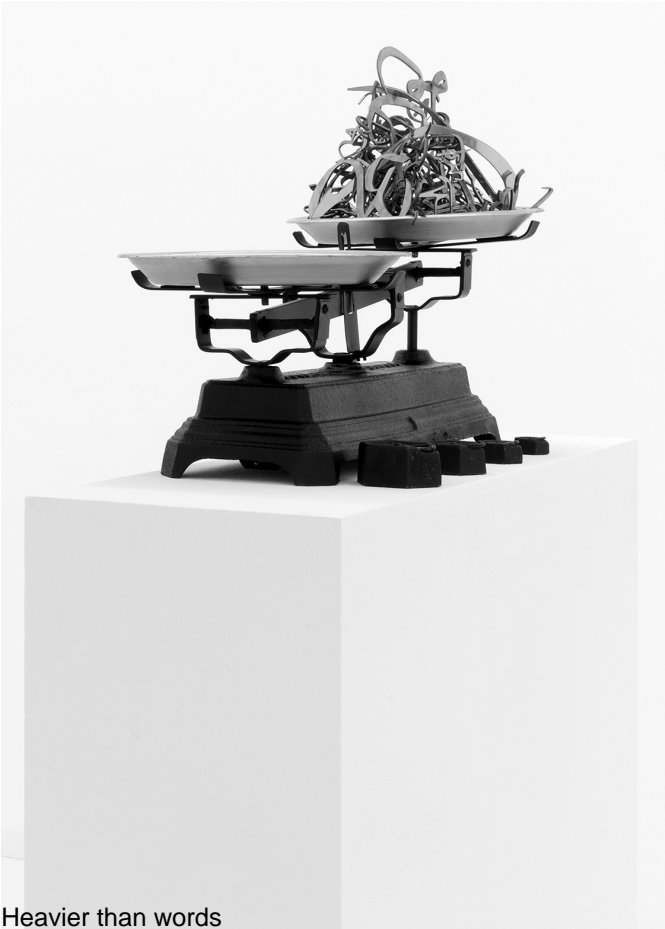
Heavier than words

The sculpture Heavier Than Words expresses a linguistic paradox, an 'unbearable lightness' of language, to quote novelist Milan Kundera's expression, and materializes the dream of a language freed from of the weight of History.