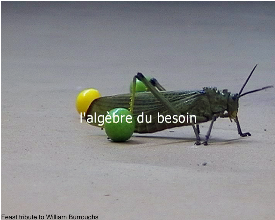
Feast tribute to William Burroughs

All those questions can be extracted from the works of William Burroughs, who was a drug addict until age forty-five, when he finally escaped from the horrors of addiction.