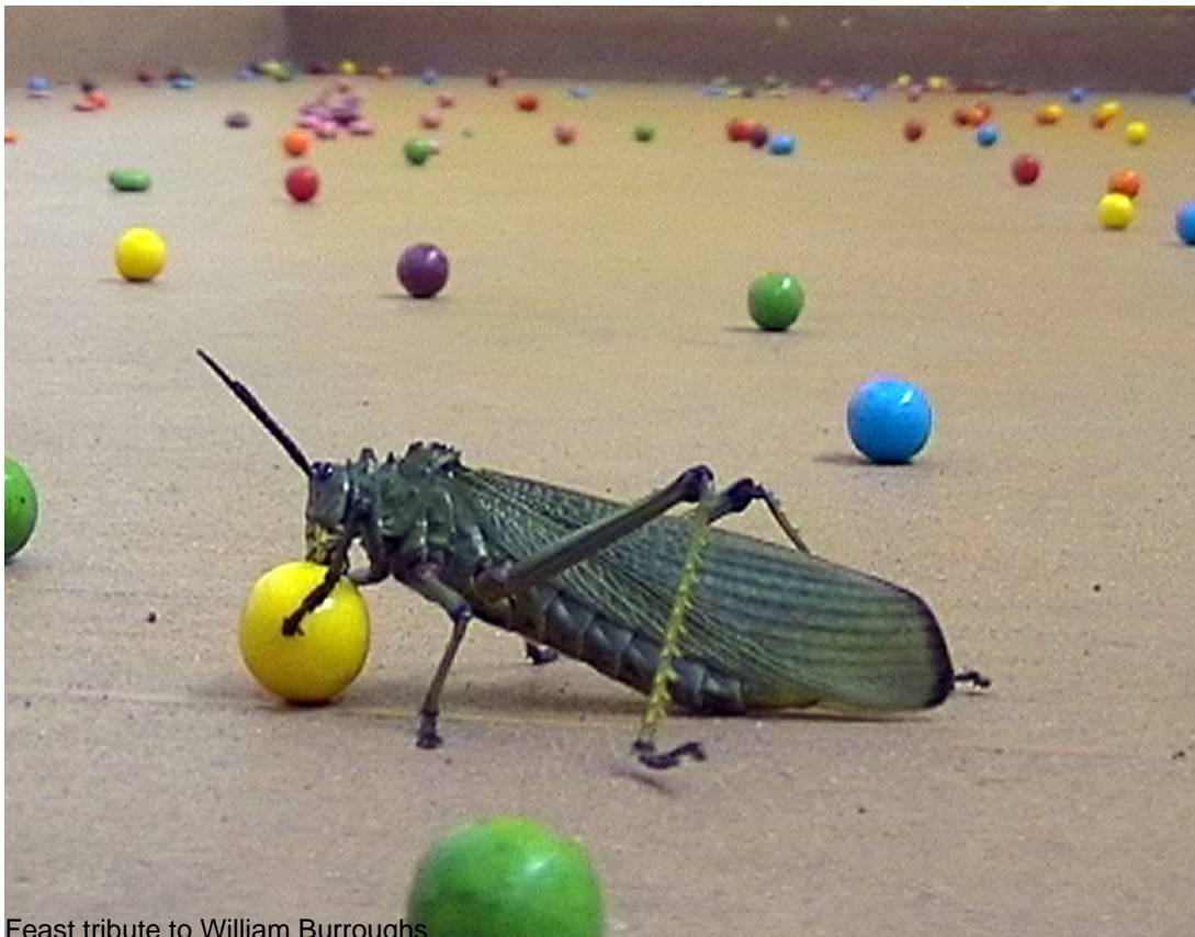
Feast tribute to William Burroughs