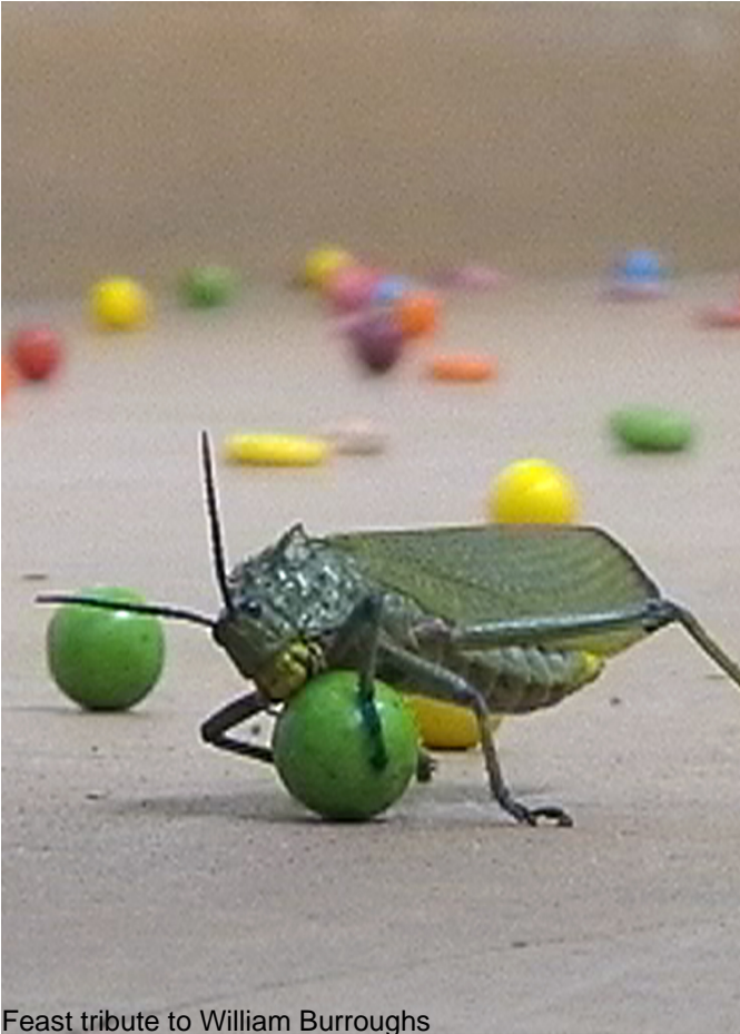
Feast tribute to William Burroughs

William Burroughs is the indefatigable champion of free will and of the infirmity of the human being, who is submitted to coercive systems of all kinds, some totalitarian, others more subtle, more sophisticated too, which take possession of the human being through pernicious and intimate ways – desire, for instance.