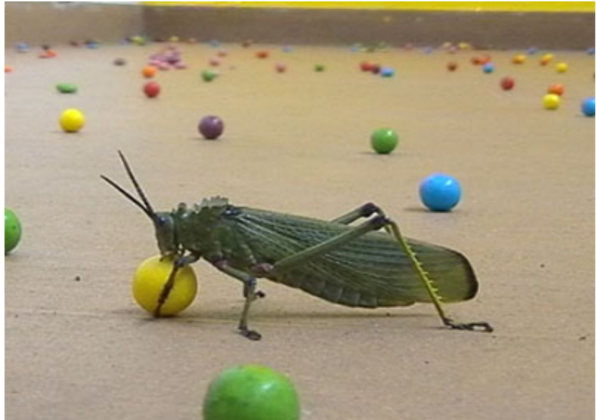
2002, France, 7 min 53, SD, 4/3, color, stereo. Ed. of 5 + 2 A.P.

This work was part of 1ère Triennale de Luanda, Angola, 2007.