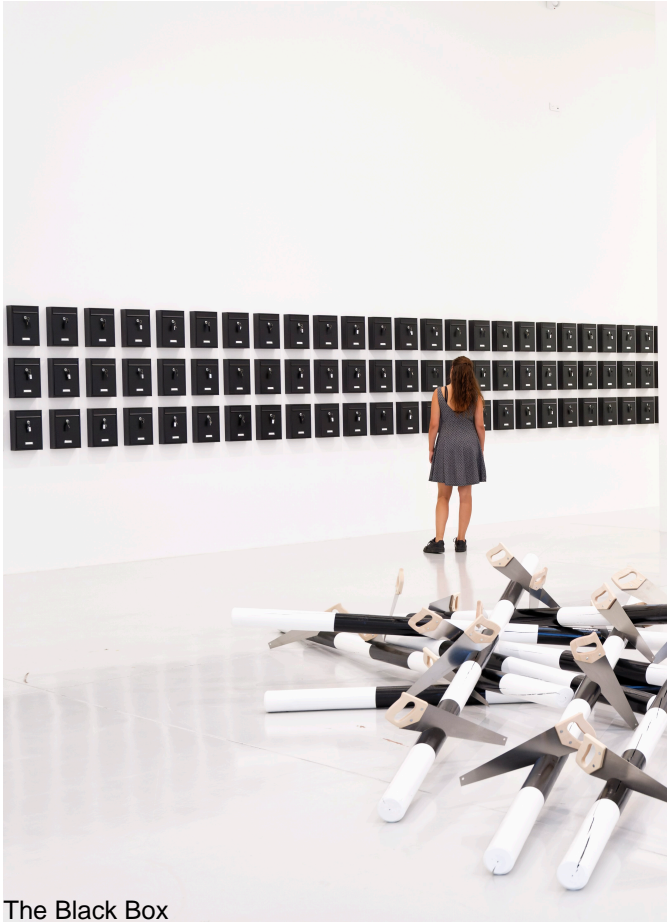
The Black Box

The installation The Black Box also brings to mind the concept of the black box, which in our collective imagination is consistently linked to airplane crashes and the search for precise information that can be found in it, in order to highlight the truth.