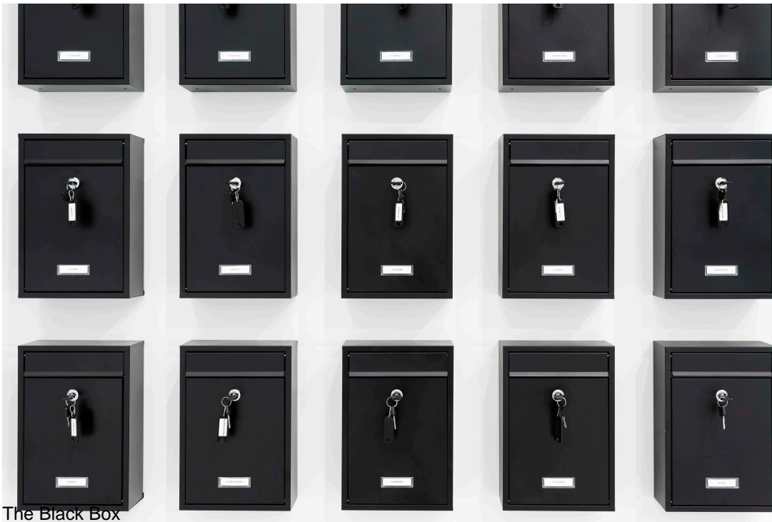
The Black Box

On the mailboxes, the names sit on the border between the intimate and the public. The denomination of beings through proper nouns, a contradictory linguistic phenomenon, identifies individuals without any ambiguity and yet doesn't say anything about their essence or attributes.