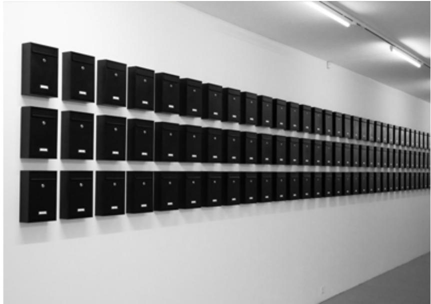
2018-2019, 99 mailboxes, 99 white labels with 99 names of god, 1030 x 116 x 9 cm. Exhibition view from The Process, Wilde Gallery, 2019, Geneva. Courtesy of the artist and Ceysson & Bénétière, Paris. Ed. of 5 + 1 A.P.

« The Black Box », est une installation réalisée au moyen de 99 boîtes aux lettres de couleur noires, disposées côte à côte, où sont reportées sur chacune d'entre elles les 99 noms de dieu recensés par la religion musulmane. En l'absence de l'image de Dieu que l'islam interdit, il est évoqué dans le Coran par différentes appellations tels Le Superbe, Le Créateur, Le Formateur ou le Tout et Très Contraignant. L'installation fait écho à la vidéo et la sculpture « Face, les 99 noms de Dieu », réalisées en 1999, étude artistique et linguistique qui explore les relations entre signes et significations, entre langage et message, entre croyance et doute. La boîte à lettre est un élément lié à l'architecture qui a cette capacité à porter notre nom et prénom pour l'afficher à l'extérieur, nous mettant ainsi en contact direct avec les autres. Recourant à cet élément architectural qui fait le lien entre l'intérieur et l'extérieur, l'installation explore le rapport entre intime et publique, entre communication et croyance.