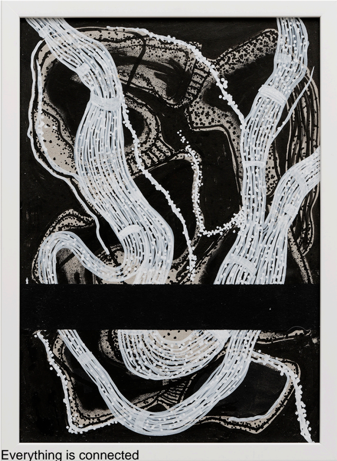
Everything is connected

Then is everything connected: life, technology, art and all the rest. The artistic project led by mounir fatmi is in search of a link, that universality which is at the heart of matter and of human creations. His artistic gesture is an attempt to unify the different levels of observation.