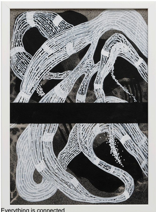
Everything is connected

Everything is Connected; the project underlying these drawings aims to emulate the living, and even all of existence. It also readily affirms the presence of links within our environment, connecting all its elements, whatever their nature. The idea is to highlight these connections, to elaborate their artistic representation in order to grant them a shape and materiality that the viewer can perceive.