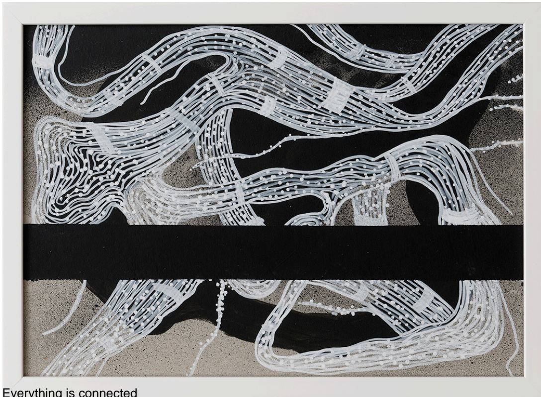
Everything is connected

The drawing project originated on one hand in Mounir fatmi's sculptures using antenna cable, and in an organic approach akin to that of a biologist studying living creatures on the other.