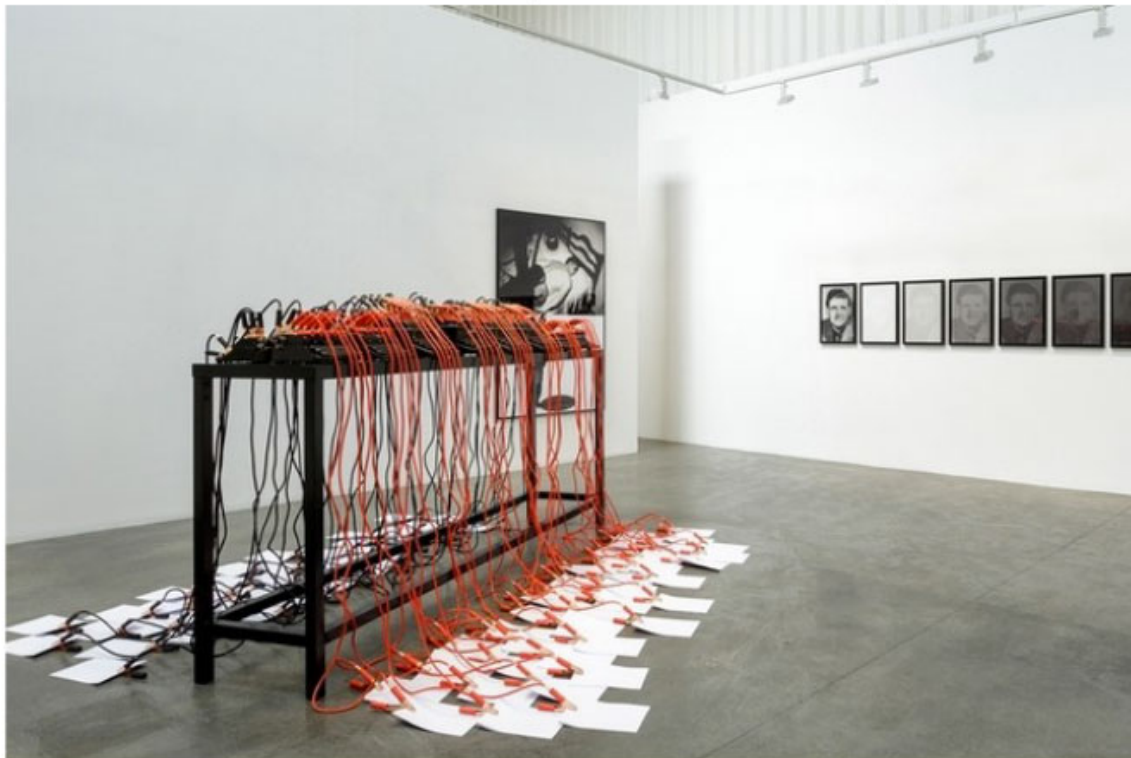
Mounir Fatmi's Inside the Fire Circle uses art to reinforce lessons of history. Jump leads spill from typewriters and photos reveal John Howard Griffin's 'colour change'.

Lessons of history come full circle in Mounir Fatmi's exhibition | The National