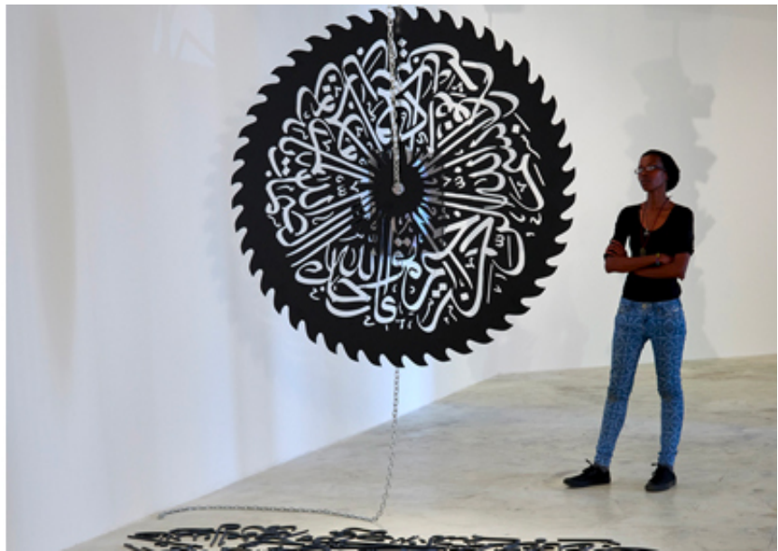
2017, Steel blade, diameter 150 cm, thickness 8 mm. Exhibition view of Fragmented Memory , Goodman Gallery, 2017, Johannesburg. Ed. of 5 + 1 A.P.

L'installation Langue maternelle emprunte la forme d'une lame de scie circulaire en acier d'un mètre cinquante de diamètre, percée de motifs calligraphiques en arabe classique. La lame est suspendue au plafond de l'espace d'exposition à l'aide d'un système de poulies et d'une chaîne à maillons passée à travers un trou pratiqué au centre du disque métallique. La chaîne traîne jusqu'au sol, que jonchent également des éléments calligraphiques découpés au laser dans le métal, disposés en tas, sans ordre apparent.