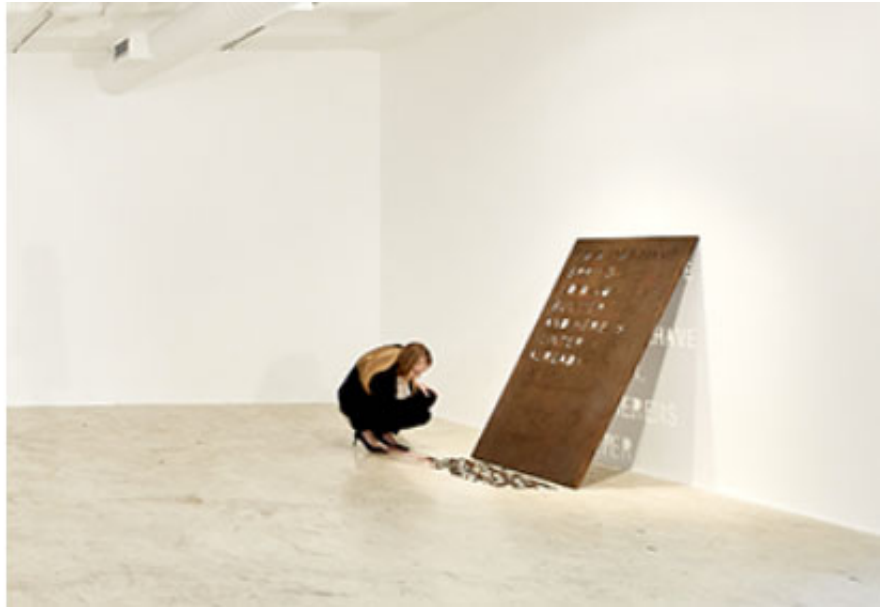
2017, Steel Variable, 170cm x 90cm x 5mm Exhibition view from Fragmented Memory, Goodman Gallery, 2017, Johannesburg. Ed. of 5 + 1 A.P.

This work was part of 13ème Biennale de Dakar - L'heure Rouge, Dakar, 2018.