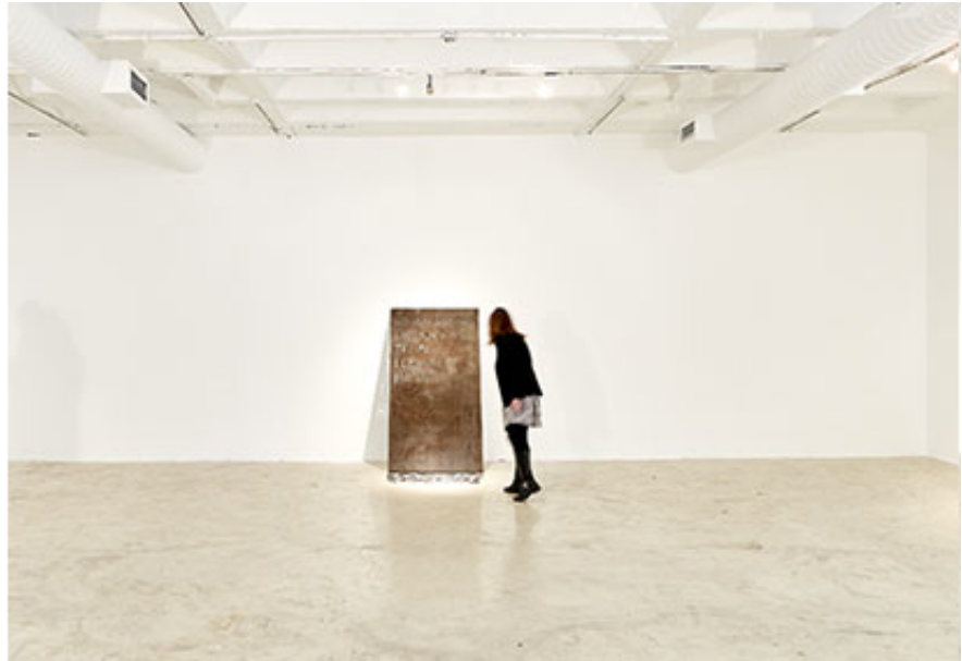
2017, Steel Variable, 170cm x 90cm x 5mm Exhibition view from Fragmented Memory , Goodman Gallery, 2017, Johannesburg. Courtesy of the artist and Ceysson & Bénétière. Ed. of 5 + 1 A.P.

This work was part of 13ème Biennale de Dakar - L'heure Rouge, Dakar, 2018.