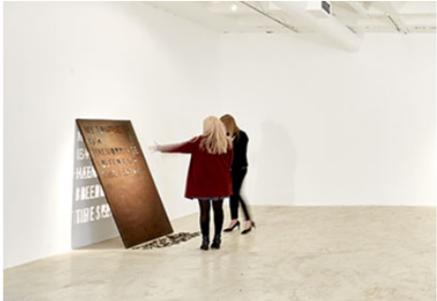
2017, Steel Variable, 170cm x 90cm x 5mm Exhibition view from Fragmented Memory , Goodman Gallery, 2017, Johannesburg. Courtesy of the artist and Ceysson & Bénétière. Ed. of 5 + 1 A.P.