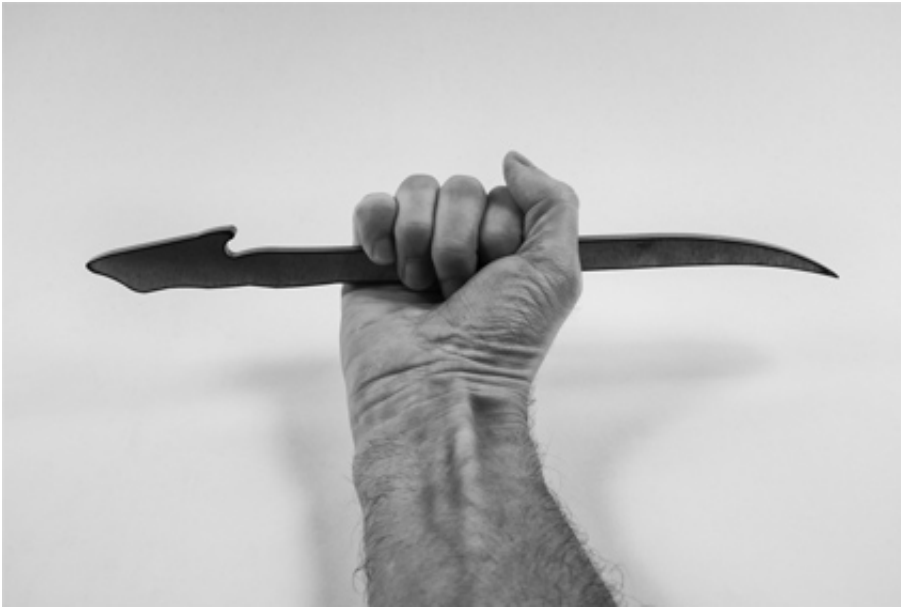
2015, Black and white ink on baryté paper 50x75 cm and 30cm x 45cm. Exhibition view of Survival Signs, Jane Lombard Gallery 2017, New York. Ed. of 5 + 2 A.P.

Alif est une œuvre photographique en noir et blanc montrant l'avant-bras d'un homme serrant dans sa main une forme légère courbe et allongée, tel un poignard. Cette série de clichés commencée en 2015 est un work in progress qui doit se développer sur un ensemble de photographies, de vidéos et d'installations.