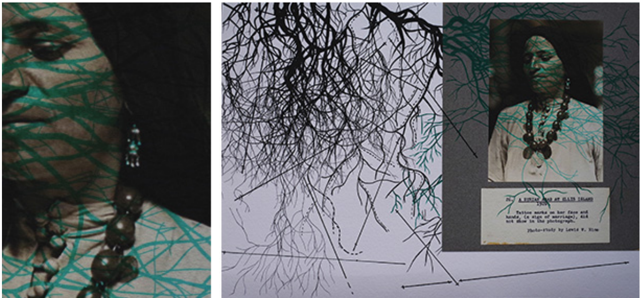
2016-2017, crayon, acrylique et encre de Chine sur papier, 35cm x 50cm Exhibition view from Drawing Now, Analix Forever, 2017, Paris.

L'interculturalité et ses richesses, son potentiel de réparation, sont l'un des fils rouges essentiels du travail de mounir fatmi, un fil rouge qui inclut la migration, l'exil, l'identité, le corps. Mais c'est aussi la volonté constante de nous surprendre, de nous faire reconsidérer nos points de vue, de nous donner à penser à l'envers.