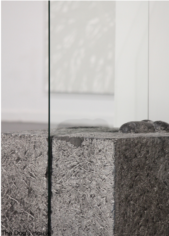
The Dog's House

This work therefore stands as a piece of architecture representing the ruins of an entire revisited civilization in which the attributes of man and woman face each other with the same size and placement.