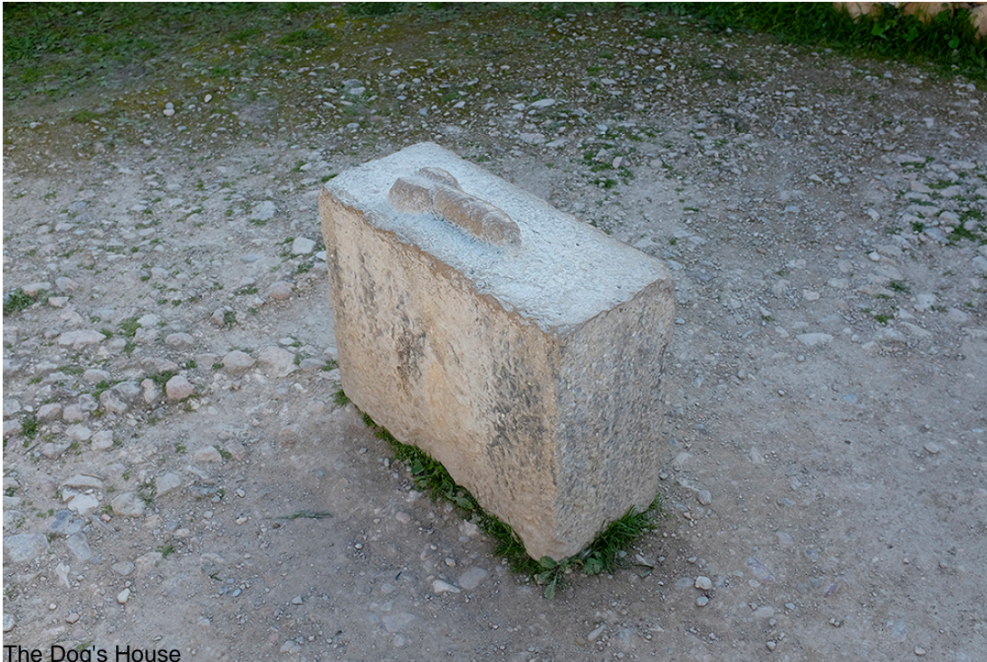
The Dog's House