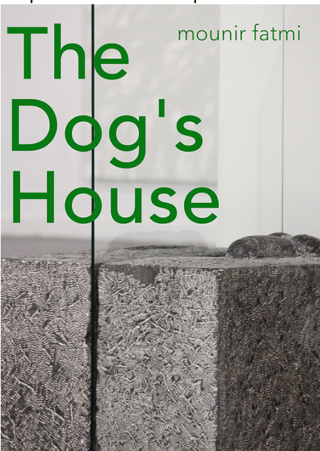
The Dog's House