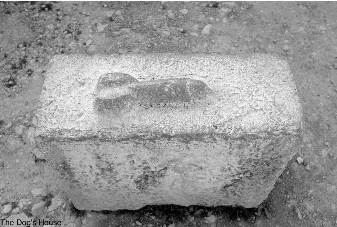
The Dog's House

This object prompts a play of superimposition between the two components of the sculpture. Whether the spectator is on one side of the sculpture or the other, the phenomenon of reflections superimposes the two sexes.