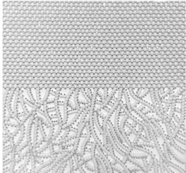
2019, coaxial antenna cable and staples, 55 x 62 cm.