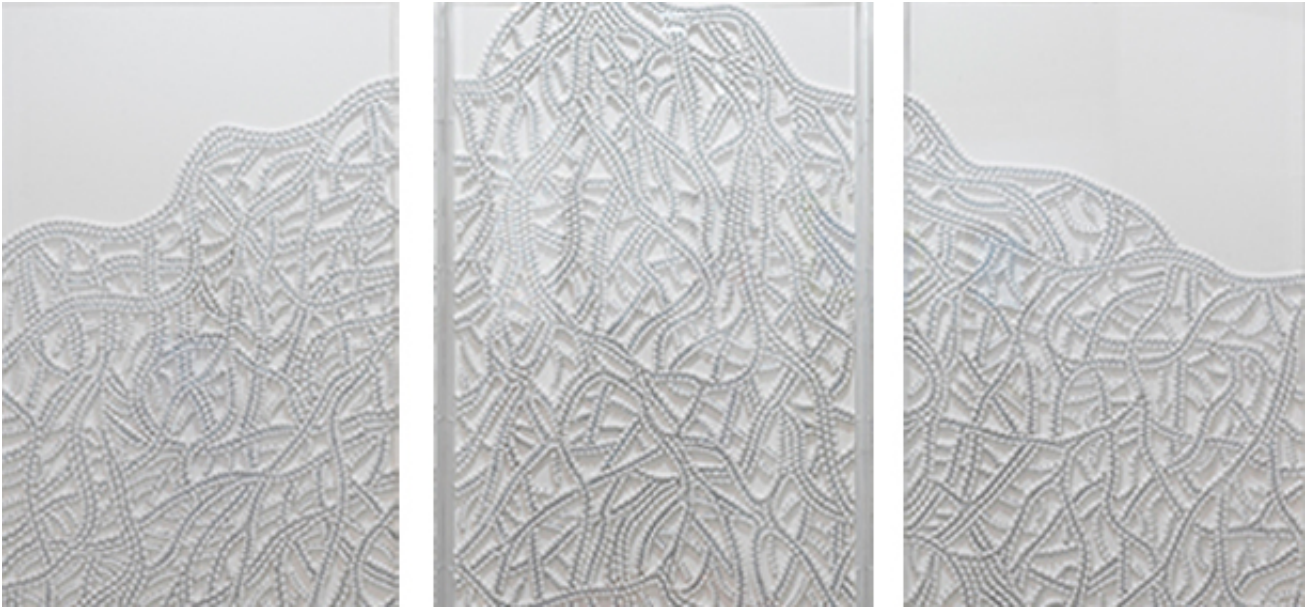
2016, triptych, coaxial antenna cable and staples, 120 x 65 cm each.