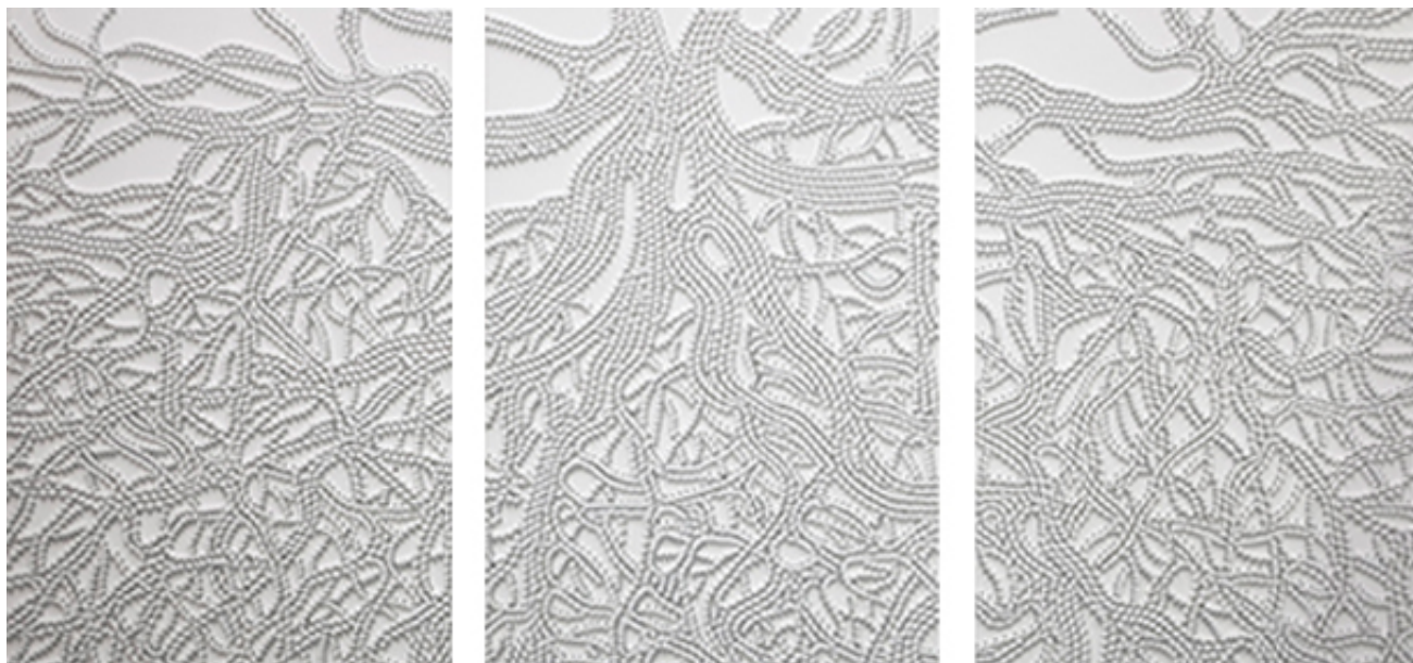
2015-2016, triptych, coaxial antenna cable and staples, 120 x 65 cm each. Exhibition view from Abu Dhabi Museum opening, 2017, Abu Dhabi. Courtesy of the artist and Ceysson & Bénétière, Paris.