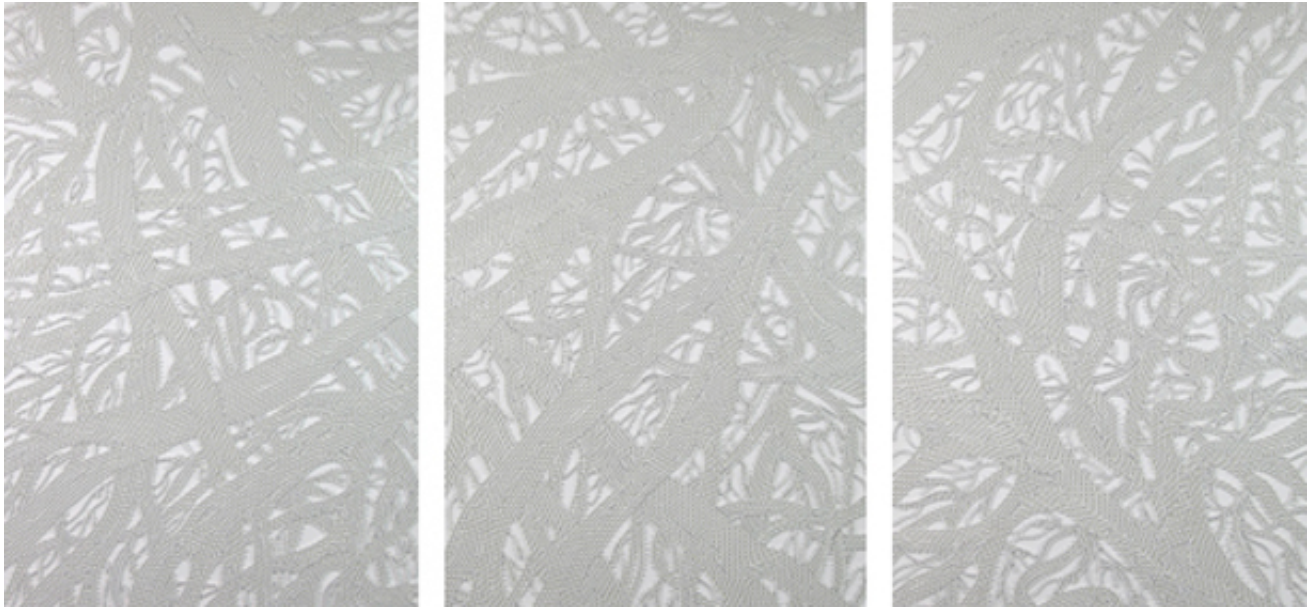
2015-2016, triptych, coaxial antenna cable and staples, 220 x 122 cm each. Exhibition view from Fragmented Memory , Goodman Gallery, 2017, Johannesburg. Courtesy of the artist and Ceysson & Bénétière, Paris.