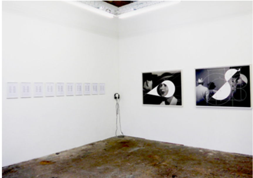
2012-2015, two pigment prints 90 x 120cm each, 10 poems 29,7 x 21 cm, 5'10min. Exhibition view of Les Fragments de l'amour, CAC La Traverse, 2015, Alfortville. Courtesy of the artist and Analix Forever, Geneva. Ed. of 5 + 1 A.P.

Les affaires des sphères est une installation associant des photomontages, des poèmes imprimés et encadrés et une pièce sonore. Les photomontages sont réalisés à partir de photographies extraites du film Casablanca , auxquelles ont été appliqués des figures géométriques. Elles mettent en scène les amants de face, lorsqu'ils s'approchent l'un de l'autre pour s'embrasser, puis le mari et la femme, observés par un troisième personnage, l'amant platonique. Les poèmes sélectionnés sont tirés de l'œuvre de Soddy (prix Nobel de chimie et mathématicien) intitulée "Le baiser précis" qui s'inspire des cercles tangents de Descartes. La pièce sonore, quant à elle, est à écouter au casque audio et mêle une voix robotique récitant un poème à une voix humaine prononçant et répétant certaines phrases comme des mantras.