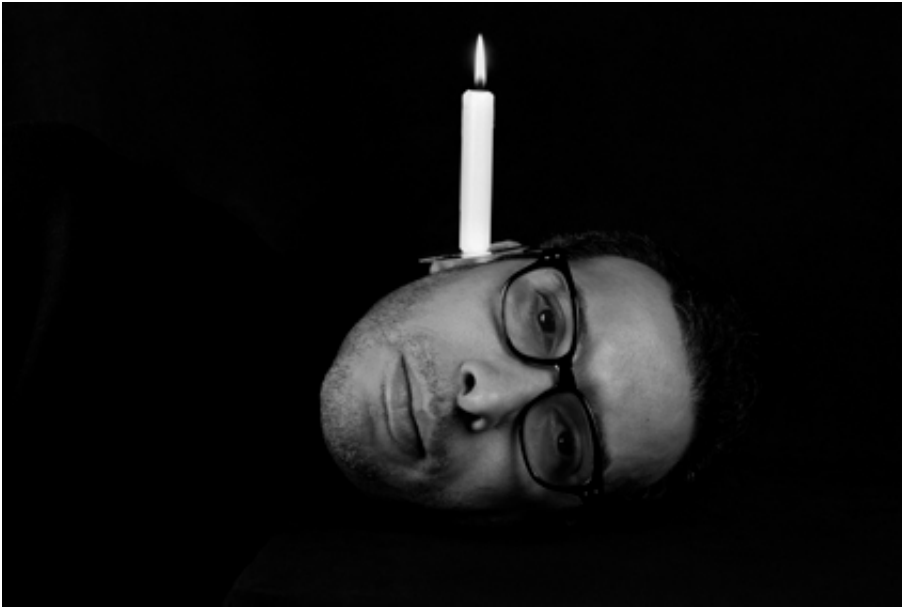
2015, triptych, pigment print on Fine art, 35 x 52 cm, each and 70 x 105 cm each. Exhibition view from Survival Signs, Jane Lombard Gallery, 2017, New York. Ed. of 5 + 2 A.P.

This work was part of 14th Biennale Africaine de la Photographie, Kuma, Bamako, 2024.