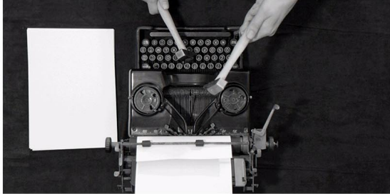
Mounir Fatmi.

7 Sep — 21 Oct 2017 at the Jane Lombard Gallery in New York, United States 12 SEPTEMBER 2017