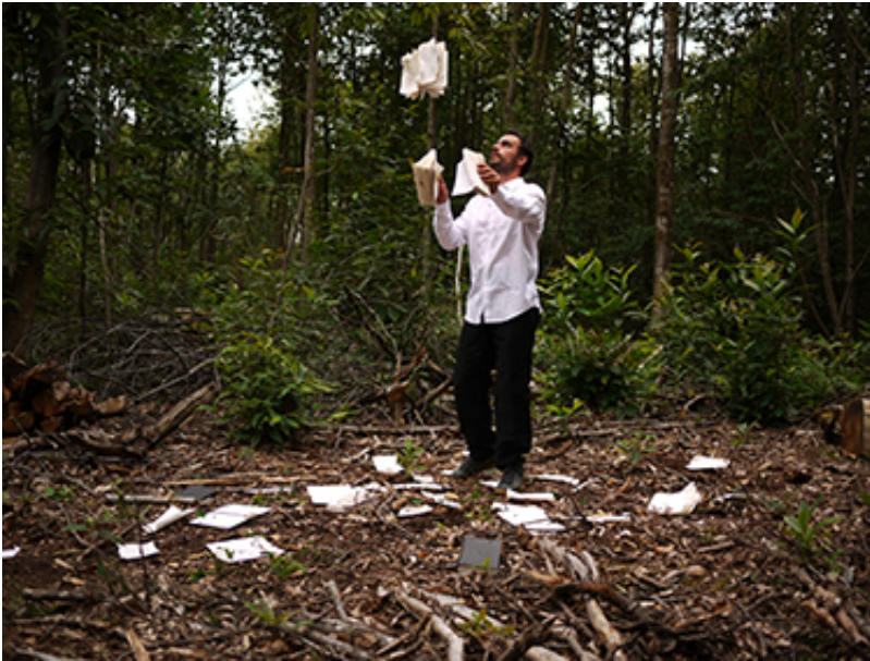
2012, pigmented ink on fine art paper, 60 x 80 cm and 122 x 170 cm. Exhibition view Traces of the Future, MMP+, 2015, Marrakech. Ed. of 5 + 2 A.P.