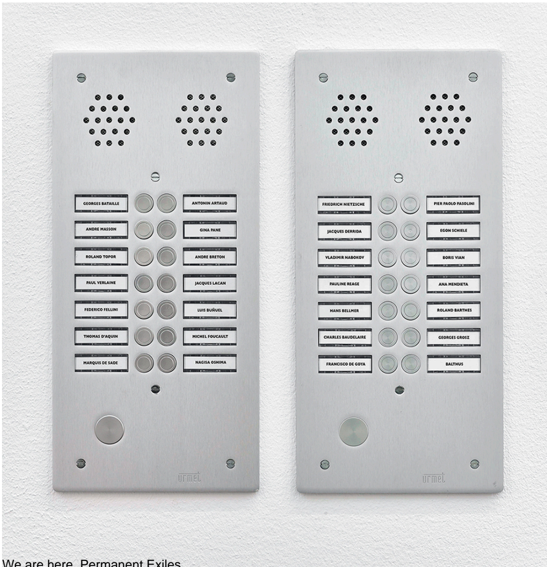
We are here, Permanent Exiles

These readymades are attached to the wall as if they still worked, representing architectural ghosts. These buildings, symbolized by these intercoms, bring an intellectual heritage to mind. This series is therefore linked to various works by mounir fatmi in terms of both architecture and thought.