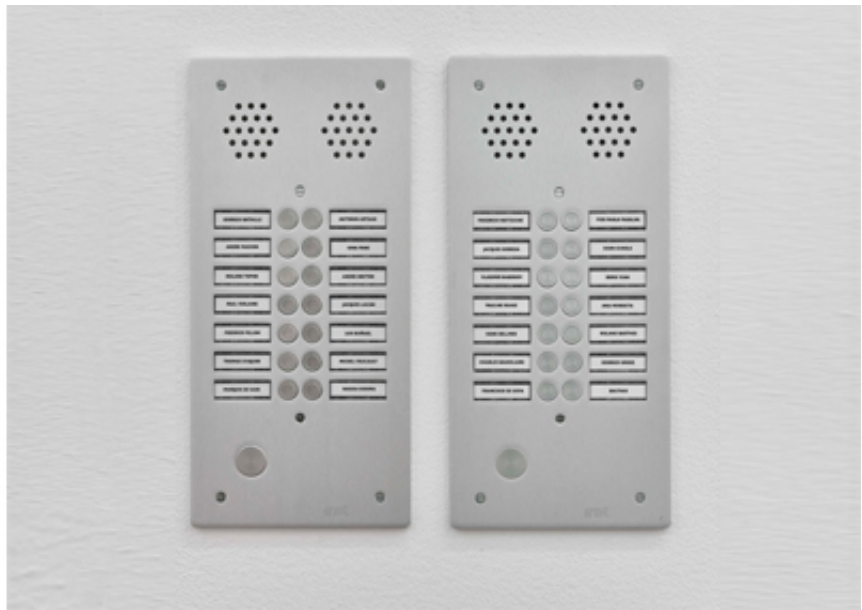
2014-2016, diptych, 38,5 x 18 cm each, doorbells in metal. Exhibition view from Depth of Field, Labanque, 2016, Béthune.