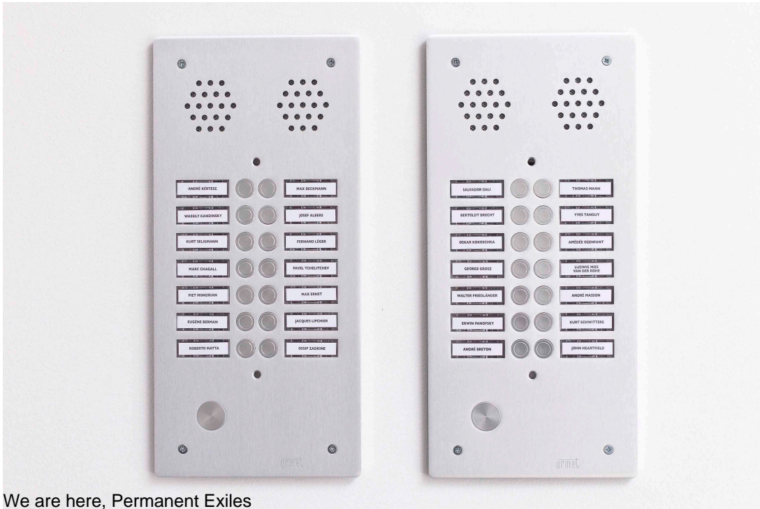
We are here, Permanent Exiles

While the notion of architecture is a clear part of this series, there is an underlying notion of disappearance. Though personalities and buildings disappear, the memory and the idea will always endure. Though the walls fall and the ruins disappear, the thought still remains.