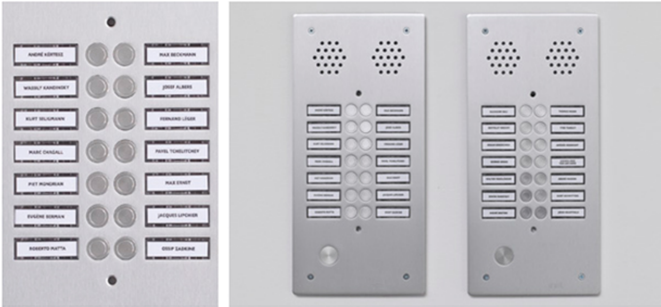
2014-2015, diptych, 38,5 x 18 cm. doorbells in metal. Exhibition view from Art in Exile, Keitelman Gallery, 2015, Brussels.