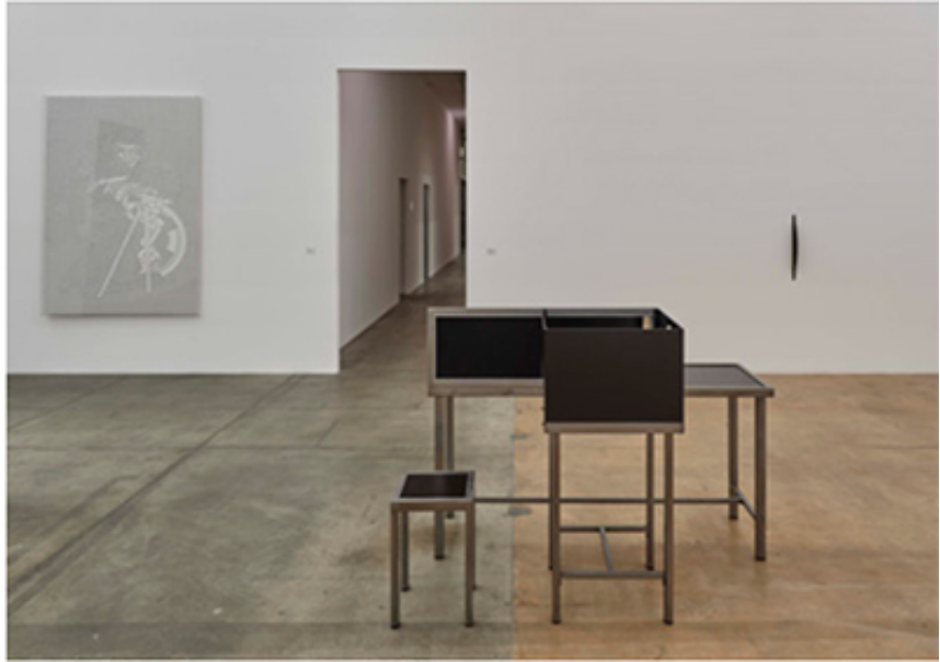
2014-2015, 150 x 45 x 75 et 50 x 50 x 75 cm, steel, mirror and wood. Exhibition view from Permanent Exiles, MAMCO, 2015, Geneva. Courtesy of the artist and Ceysson & Bénétière, Paris. Ed. of 5 + 1 A.P.

Construire des illusions : on pourrait croire c'est ce que font les fabricants d'image, ces femmes et ces hommes que l'on appelle artistes... Mais en réalité, les artistes, en construisant leurs images, leurs œuvres, nous amènent avant tout à reconsidérer le monde d'un point de vue différent, et à nous interroger, sur l'illusion.