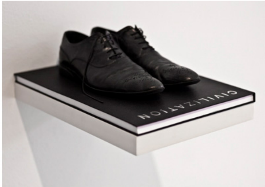
2013, 30 x 43 cm, the artist's shoes, book. Exhibition view from Darkening Process, MMP+, 2016, Marrakech. Courtesy of the artist and Ceysson & Bénétière, Paris. Ed. of 5 + 1 A.P.

Civilisation attire le spectateur en exerçant sur lui une séduction comparable à celle d'une vitrine de chausseur de luxe. Une paire de chaussures noires en cuir lustré repose sur un livre de grand format lui-même juché sur un présentoir blanc immaculé. La couverture de l'ouvrage, en vélin de couleur noire, laisse apparaître son titre, inscrit en anglais et en lettres majuscules à l'élégante typographie argentée : "CIVILIZATION".