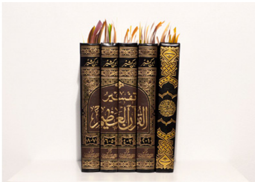
2013, one Koran and a guide to understanding the Koran in 4 volumes, 30 x 40 x 30 cm. Exhibition view from Art Dubai, Galerie Hussenot, 2013, Dubai.