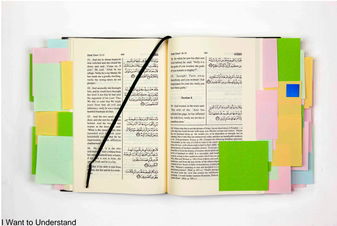
I Want to Understand