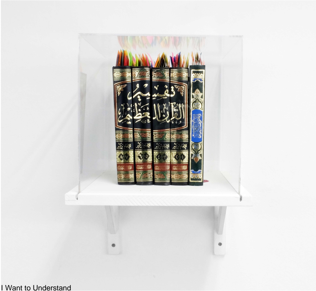
I Want to Understand

I Want to Understand impresses the viewer with both the quantity of scripture and knowledge contained in these books, and the quality of the sumptuous bindings. One could stop the analysis here, indeed it would be tempting to imagine meaning forever locked away in these weighty tomes - as if merely possessing such books is enough, dispensing the owner of the tiresome task of having to read them.