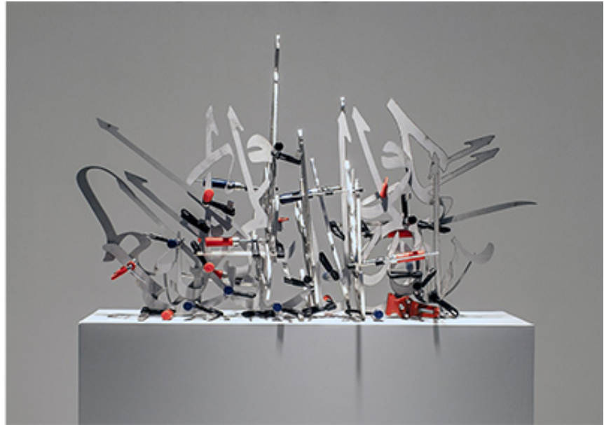
2012-2016 Steel, clamps Exhibition view from A Savage Mind, Keitelman Gallery, 2016, Brussels.