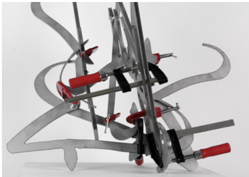
2012-2016, steel, clamps, 56 x 46 x 52 cm, pedestal: h107 x 45 x 45 cm. Exhibition view from Art Cologne, Conrads Gallery, 2016, Cologne.

Calligraphie de feu est une série sculpturale montrant des phrases déconstruites. Des calligraphies arabes découpées dans des plaques de métal tenues par des pinces et prises en étau, prennent la forme de flammes. Cette série se développe en deux formes distinctes. La première, plus ramassée, rappelle nettement la forme d'une seule flamme. La seconde, plus développée, évoque la structure d'une phrase comme une flambée suivant son propre cheminement.