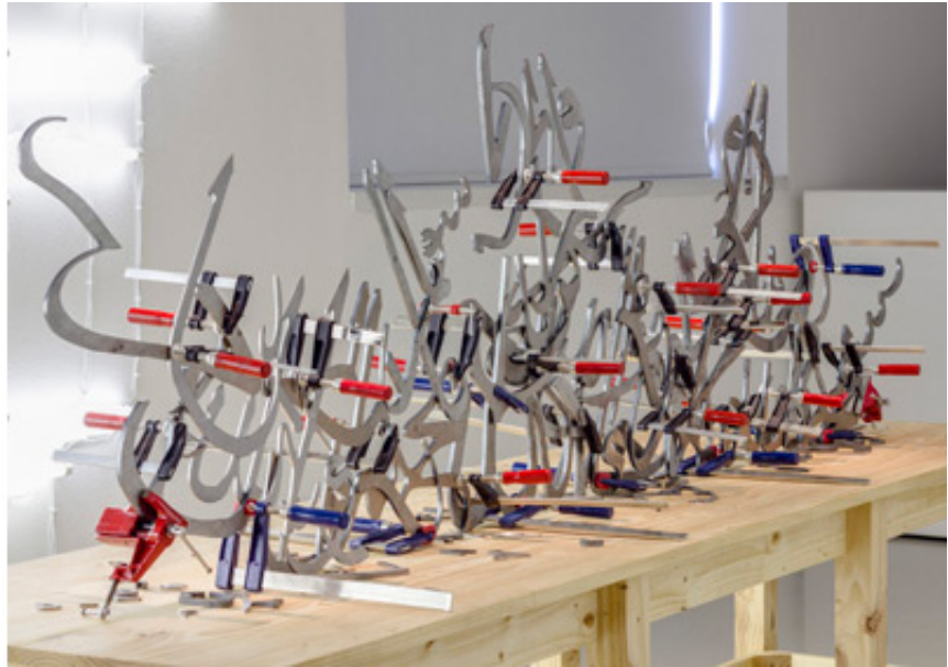
2012, steel, clamps, table, 120 x 160 cm. Exhibition view from Suspect Language, Goodman Gallery, 2012, Cape Town. Ed. of 5 + 1 A.P.

Calligraphie de feu est une série sculpturale montrant des phrases déconstruites. Des calligraphies arabes découpées dans des plaques de métal tenues par des pinces et prises en étau, prennent la forme de flammes. Cette série se développe en deux formes distinctes. La première, plus ramassée, rappelle nettement la forme d'une seule flamme. La seconde, plus développée, évoque la structure d'une phrase comme une flambée suivant son propre cheminement.