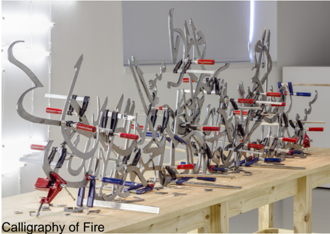
Calligraphy of Fire

The foreign point of view that an artist like Gysin could have on Arab calligraphy and the application of the "cut-up" technique leads these letters to assume full independence. Faced with an imagery in its own right, Gysin's works end up being defined only by their basic material, the word.