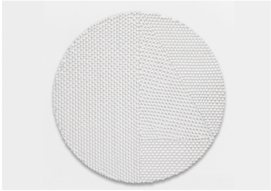
2019, coaxial antenna cable on plywood, plexiglass, diameter of 70 cm.

Les Cercles, avec leur aspect blanc immaculé et épuré, leur jeu d'associations des formes, de tensions entre lignes droites et courbes, de révélation et d'occultation des figures, attirent le regard autant qu'ils soulèvent de questions. La série des Cercles est réalisée au moyen de câbles d'antennes blancs - matériau récurrent des œuvres de Mounir Fatmi depuis 1998, disposés en motifs géométriques, puis fixés à des panneaux blancs et circulaires à l'aide d'attaches à tête rondes. Les compositions obtenues sont parfois surmontées d'un second panneau circulaire blanc en plexiglas, découpé à certains endroits, et laissant apparaître les câbles coaxiaux.