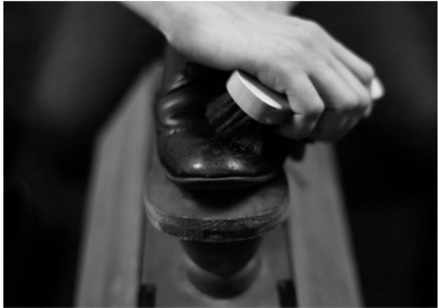
2014, France, 9 min 35, HD, colour, stereo. Ed. of 5 + 2 A.P.

Dans son film expérimental, Darkening Process (2014), mounir fatmi explore la vie de John Howard Griffin, écrivain américain et activiste des droits civiques qui, exacerbé par l'injustice subie par les Afro-Américains pendant les années 1950 et 1960, alla jusqu'à noircir sa peau à l'aide de pilules et d'exposition prolongée sous ultraviolets. En dépit d'études en littérature française, en religion et en médecine, et malgré un service dans l'armée américaine, le seul métier que Griffin ait pu obtenir était cireur de chaussures. Le film Darkening Process est construit autour du plan rapproché sur une paire de mains frottant et cirant énergiquement un pied de chaussure en cuir noir. À vue d'œil, l'action s'assombrit fil de la vidéo, tandis que les mains appliquent une partie du cirage noir sur la peau.