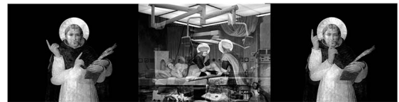
1. mounir fatmi The Silence of Saint Peter Martyr, 2011 video HD in bianco e nero con audio, 5'04" edizione di 5

During the opening ceremony of Thursday, October 26th at 7 pm, a performance at the presence of the artist will be held. It will be built around his installation Constructing Illusions , a participatory work that plays on the equilibrium between imagination and reality: concepts that often mingle with each other until they manage to completely exchange meanings.