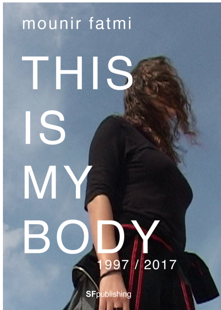
This is my Body, Sf Publishing 2019

When hearing the name mounir fatmi, one can't help but think of his sculptures and installations addressing the issues of free expression and censorship. His works, both material and immaterial, all have in common striking concepts and powerful images. Video is his preferred medium. Contrary to a painting where the image remains motionless and unchanging, a screen always offers the possibility of being turned off, thus making the work disappear, of giving it life or not at any chosen moment.