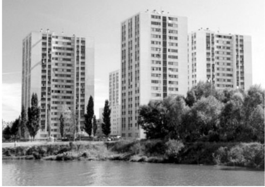
2010-2011, France, 26 min 21, HD, color, stereo. Ed. of 5 + 2 A.P.

This work was part of 5th Auckland Triennial - If you were to live here, Auckland, 2013.