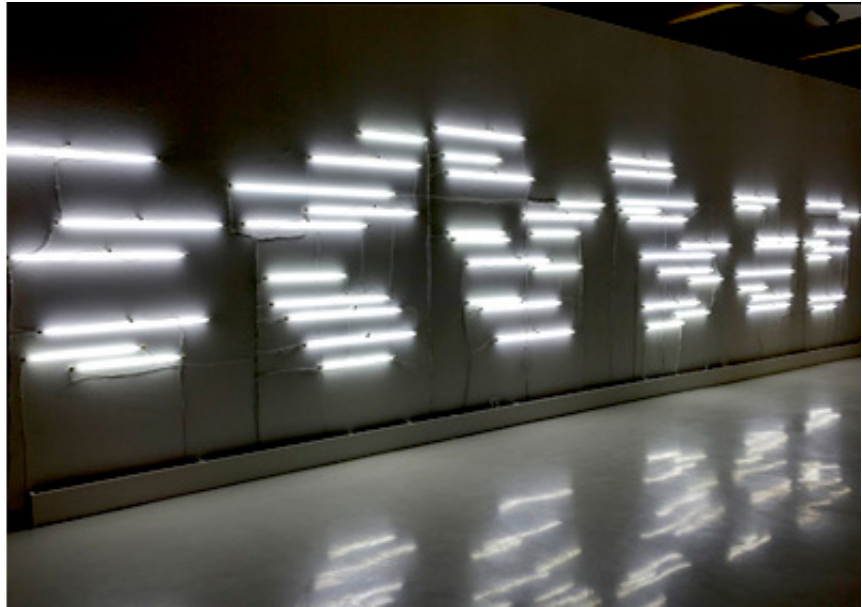
2012, fluorescent tubes, size may vary. Exhibition view of Suspect Language, Goodman Gallery, 2012, Cape Town. Ed. of 1 + 1 A.P.

Jusqu'à preuve du contraire est une installation sculpturale composée de dizaines de néons se déployant du plafond vers le sol. Cette structure lumineuse s'étend tel un arbre dans une dynamique ascendante. Les néons horizontaux, au sol, tiendraient place de racines tandis que les verticaux seraient un tronc puissant et massif s'élançant vers les cieux. Sur chacun des tubes est reproduit en anglais ou en arabe différents versets de la sourate 24 du Coran, intitulée « La lumière ». On peut donc apercevoir des maximes et impératifs moraux louant un dieu transcendant et omniscient et où la symbolique de la lumière lui est associée. Notamment dans le verset 36 où il est dit : « Dieu est la Lumière des cieux et de la terre. Sa lumière est semblable à une niche où se trouve une lampe. La lampe est dans un cristal, qui ressemble à un astre de grand éclat ; son combustible vient d'un arbre béni : un olivier ni oriental ni occidental dont l'huile semble éclairer sans même que le feu la touche. »