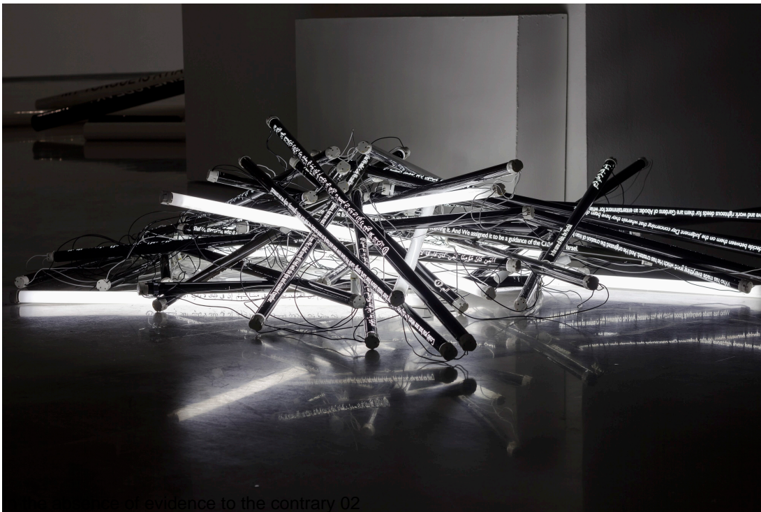
In the absence of evidence to the contrary 02