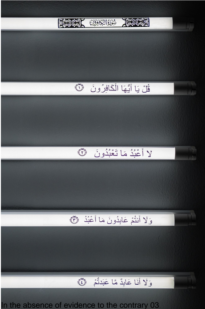
In the absence of evidence to the contrary 03