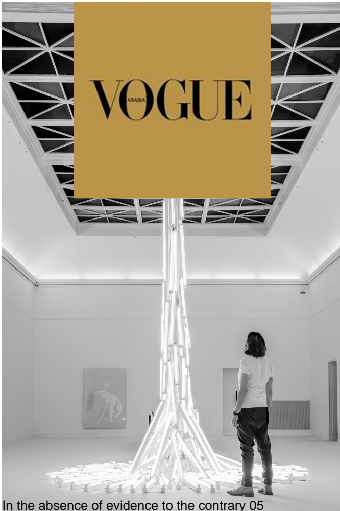
In the absence of evidence to the contrary 05

In the Absence of Evidence to the Contrary therefore works as a visual trap. The eye of the spectator moves from one language to the other, without being able to define the words. He or she is thus required to approach the light in order to read the text on the luminescent tubes. In this hypnotic epiphany, the visible text tests our retinal tenacity.