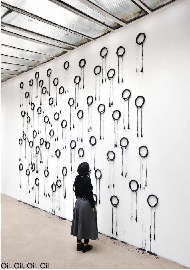
Oil, Oil, Oil, Oil

The agals were dipped in black paint before being attached to the white wall in the exhibition space, where they leave long trails of black liquid streaming down to the ground.