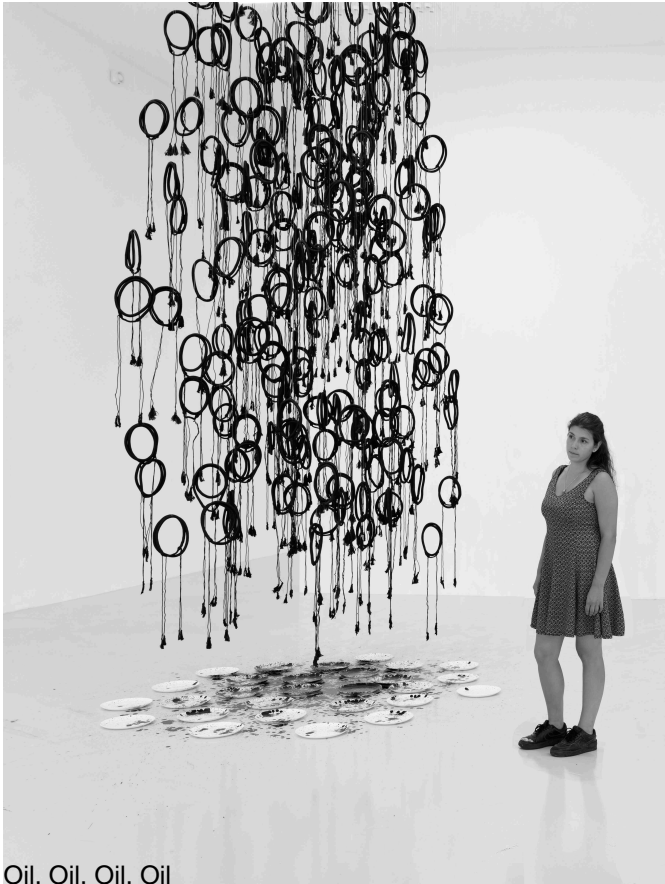
Oil, Oil, Oil, Oil

The viewer is given the liberty to imagine that these black curls are reminiscent of the many zeros that are found in the oil industry's bookkeeping as it generates billions, or perhaps they can be seen as greedy mouths from which dark liquid flows as they seem against all reason seem to cry out for more, Oil, Oil, Oil, Oil!