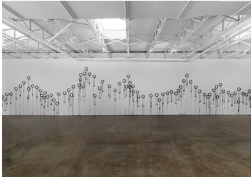
2023, agals, variable size. Exhibition view from Whispered Stories of Forgotten Wires , Piero Atchugarry Gallery, 2023, Miami. Ed. of 5 + 1 A.P.

Oil, Oil, Oil, Oil installe le spectateur dans un face à face avec une œuvre qui met à l'épreuve sa patience et sa résistance en le confrontant à la vision obsédante d'une composition répétant un unique motif. L'installation, présentée à la galerie Jane Lombard à New York en 2012 et à la galerie Yvon Lambert en 2014, est réalisée au moyen d'agals, accessoires du vêtement traditionnel arabe fait de corde, qu'on attache autour du keffieh pour le maintenir en place. Les agals ont été trempés dans de la peinture noire avant d'être fixés sur le mur blanc de l'espace d'exposition où ils laissent de longues traînées de liquide noir allant jusqu'au sol. L'agal vient rejoindre la liste des objets détournés de Mounir Fatmi tels que les câbles d'antenne, la cassette VHS, la barrière hippique ou encore les balais.