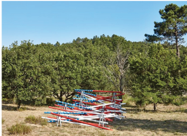
I Like America – Tribute to Jacques Derrida (J'aime l'Amérique – Hommage à Jacques Derrida); courtesy the artist and FNAC (France)