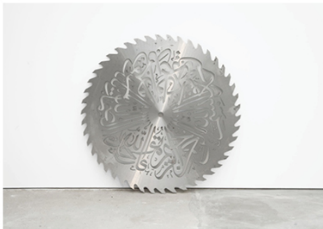
Between the Lines