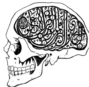
Hard Head (courtesy the artist and the Collection Les Abattoirs at the Musée d'Art Moderne et Contemporain in Toulouse, France)