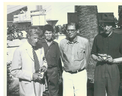
L-R: Paul Bowles, Gregory Corso, Allen Ginsberg, and William Burroughs in Tangier in 1961