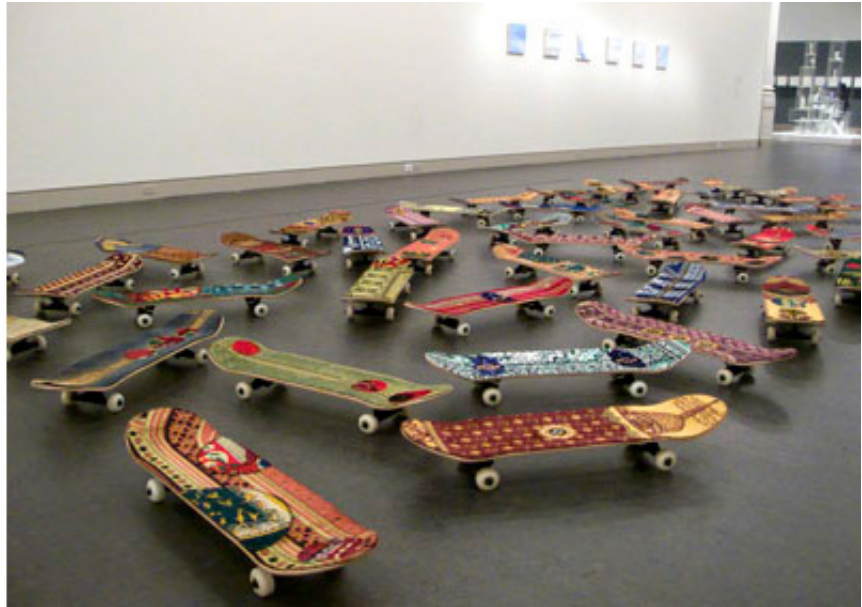
2010, 50 skateboards, prayer rugs. Exhibition view of Unfolding Tales , The Brooklyn Museum, 2011, New York. Ed. of 5 + 1 A.P.