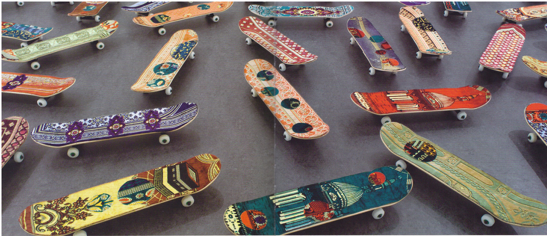
mounir fatmi (Moroccan, b. 1970). Maximum Sensation , 2010. Plastic, metal, and textile; fifty skateboards, 5 x 8 x 31 1 / 2 in. (12.7 x 20.3 x 80.5 cm) each; overall dimensions variable. Purchased with funds given by John and Barbara Vogelstein and Stephanie and Tim Ingrassia, 2010.67. © mounir fatmi

In mounir fatmi's striking installation Maximum Sensation , fifty skateboards carpet the floor, each covered with a colorful patchwork collage pieced together from cut-up prayer rugs. Referring simultaneously to the devout Muslim act of prayer and to the freewheeling pastime of skateboarding, two divergent cultural practices whose reach has expanded well beyond their original roots, Maximum Sensation examines the collisions that occur with greater frequency in this era of globalization. The piece, suggesting both a sense of displacement and the phenomenon of cultural hybridity, seems to reflect fatmi's own experience as a Moroccan-born artist living in Paris. As he remarked in a recent interview, "I am Moroccan, Arab, Muslim geographically, Mediterranean, African," acknowledging that one's identity is a construct that shifts depending on the context. Like Save Manhattan , his much-admired piece in the 2007 Venice Biennale that utilized stereo speakers to re-create the pre-September 11, 2001, skyline of Lower Manhattan, Maximum Sensation employs strategies of defamiliarization to challenge fixed points of view. —ET