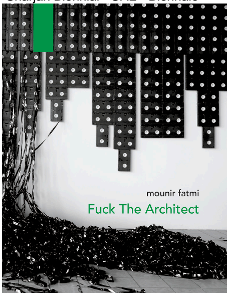
Sharjah Biennial, 2007, UAE