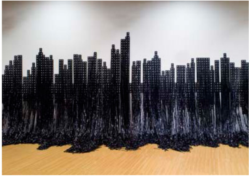
2007, VHS, tapes, 800 x 365 cm. Exhibition view of Fuck Architects: chapter III, FRAC Alsace, 2009, Sélestat. Ed. of 5 + 1 A.P.

This work was part of 8th Sharjah Biennial, 2007, UAE.