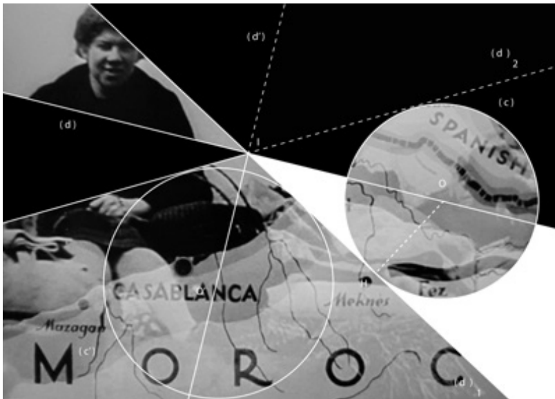
2012, print on baryte paper, 90 x 120 cm. Ed. of 5 + 2 A.P.

Read the text by Régis Durand : A continuous building up , 2014