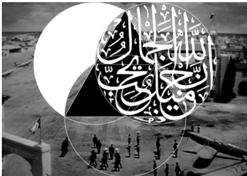
2012, print on baryte paper, 90 x 120 cm. Ed. of 5 + 2 A.P.

Read the text by Régis Durand : A continuous building up , 2014