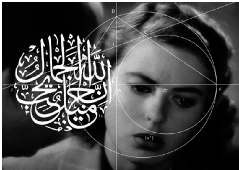
2012, print on baryte paper, 90 x 120 cm. Ed. of 5 + 2 A.P.

Read the text by Régis Durand : A continuous building up. 2014