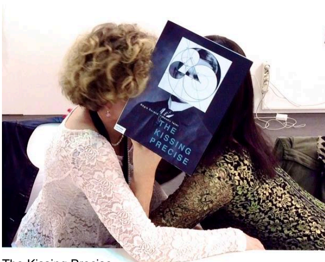
The Kissing Precise