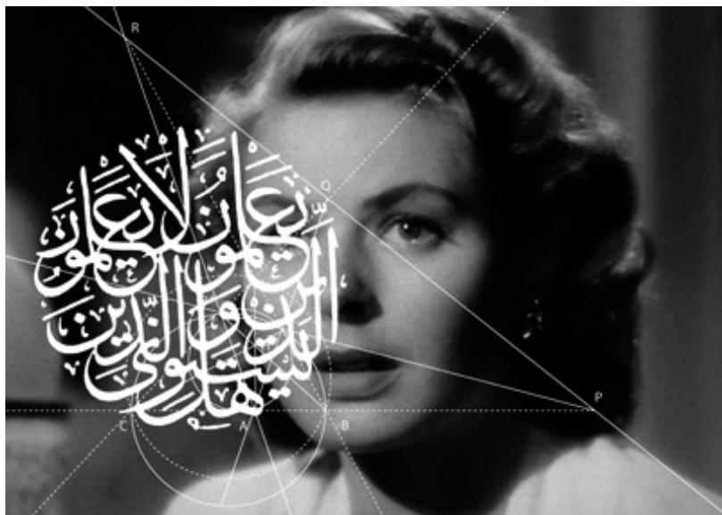
2012, print on baryte paper, 90 x 120 cm. Ed. of 5 + 2 A.P.

Read the text by Régis Durand : A continuous building up. 2014