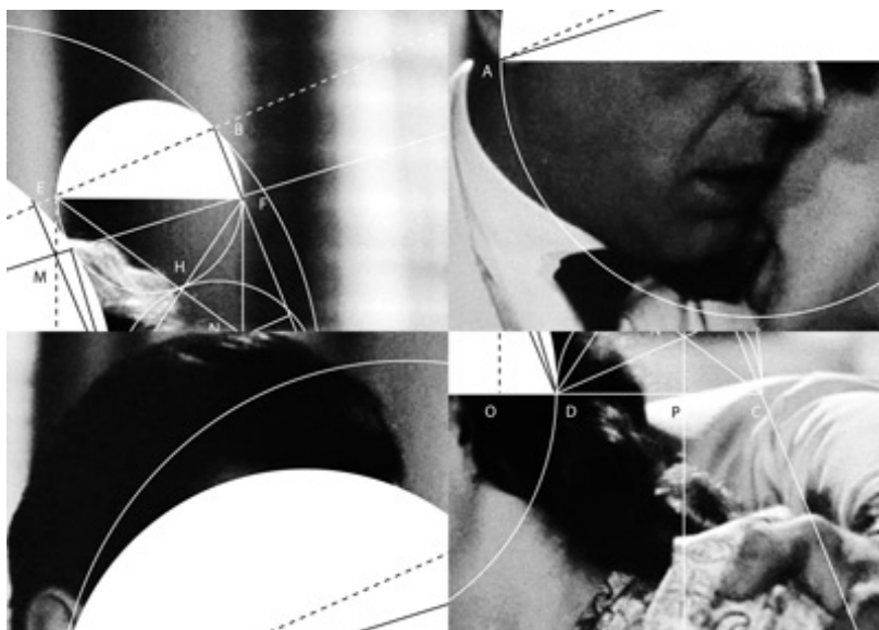
2012, print on baryte paper, 90 x 120 cm. Ed. of 5 + 2 A.P.

Read the text by Régis Durand : A continuous building up. 2014