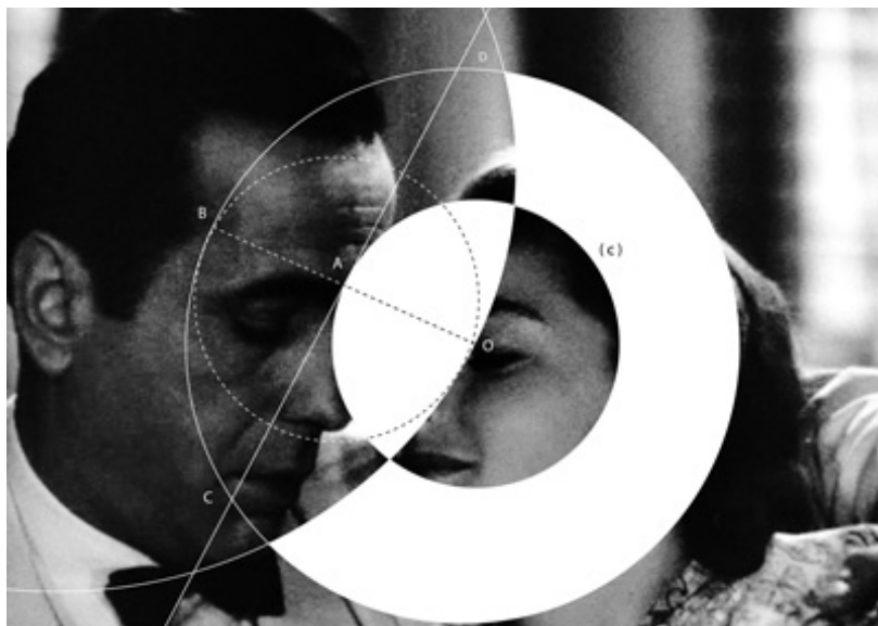
2012, print on baryte paper, 90 x 120 cm. Ed. of 5 + 2 A.P.

Read the text by Régis Durand : A continuous building up , 2014