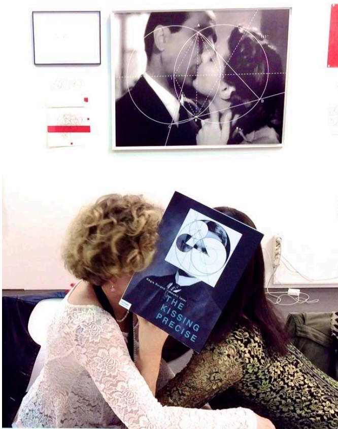
The Kissing Precise

For pairs of lips to kiss maybe Involves no trigonometry. 'Tis not so when four circles kiss Each one the other three. To bring this off the four must be As three in one or one in three. If one in three, beyond a doubt Each gets three kisses from without. If three in one, then is that one Thrice kissed internally.