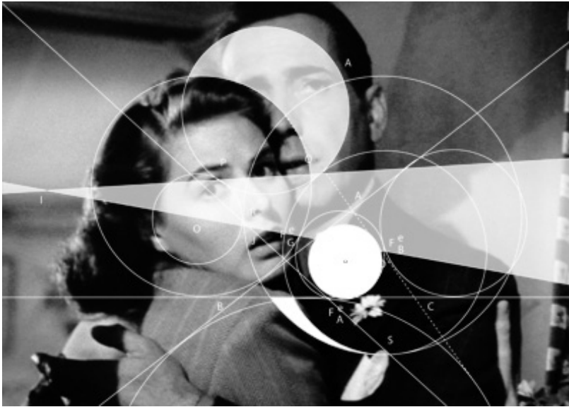
2012, print on baryte paper, 90 x 120 cm. Unique piece + 2 A.P.

Read the text by Régis Durand : A continuous building up , 2014